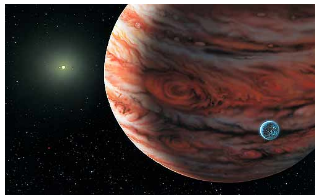
Artist's conception of the planetary system orbiting the nearby star 55 Cancri as seen from a Jupiter-like planet, at a distance approximate to that of Jupiter from our own Sun. GSMT will be able to analyze the light from this planet, determine its chemical composition, and infer the mechanism by which it formed. NASA's Terrestrial Planet Finder will enlarge the sample for GSMT analysis.

Not surprisingly, next on NASA's list of major astronomical observatories is the Terrestrial Planet Finder (TPF), a telescope specially constructed for the extraordinarily difficult job of detecting planets as small as Earth around the few hundred stars nearest our Sun. The GSMT will have remarkable, unique capabilities to study the formation of stars, observing how they assemble and how their birth leaves behind a disk of dust and ice that will build their families of planets. Its breakthrough capabilities will provide us with the clearest pictures of stars as they are born. In addition, GSMT will allow us to detect giant planets around nearby stars, the perfect complement for the TPF's search for Earth-sized planets around the same stars. Both will be needed to find true analogues to our own solar system—giant planets on stable orbits guarding the existence of vulnerable Earth-like worlds in the "habitable zone"—where life can begin and flourish. The TPF will be the GSMT's partner after JWST has retired.